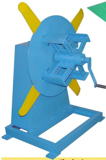
↑ 單邊式 Single Head Uncoiler